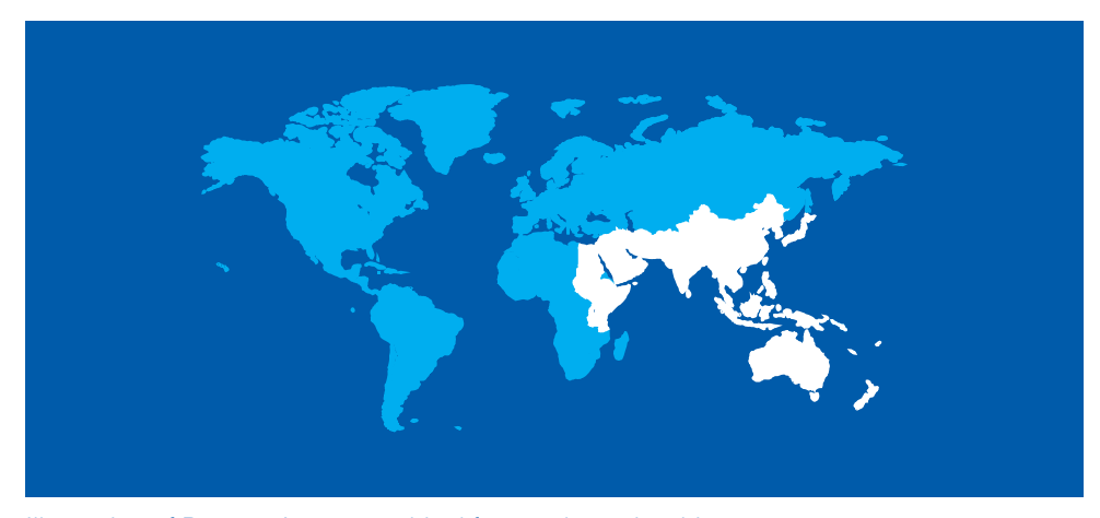
Illustration of Borouge's geographical focus, shown in white

Asia continues to motivate and inspire our development and growth.