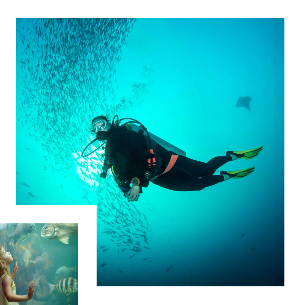
CREATING NEW POSSIBILITIES